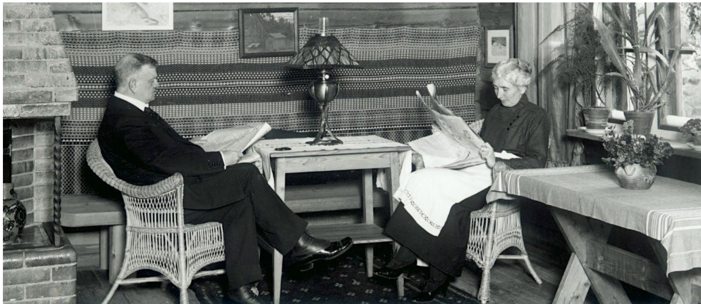
Sibelius and Aino Reading at Home

enhanced by a series of gramophone records of his music. In the 1930s, listeners of a US radio station voted him the most popular composer in the world.