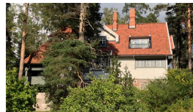
Ainola: Home of Sibelius and Aino

Despite his artistic success, Sibelius had great difficulty managing his finances. Sibelius was a heavy drinker and well-known cigar smoker, who always seemed to be in debt. Aino earned money through the translation of French literature, which likely helped the family survive. By 1897, just five years after their marriage, Sibelius was so well-established as Finland’s leading composer, that the Finnish Senate voted to grant him a small pension for life, in recognition of his outstanding genius, thus providing him with a limited but stable source of income. It was also intended as a form of compensation for his failure to secure the coveted position of Professor of Music in Helsinki. Private benefactors also helped, but the composer’s chronic alcoholism and poor fiscal management put a constant strain on his health and his marriage.