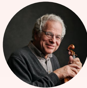
Itzhak Perlmán in Recital March 16, 2024