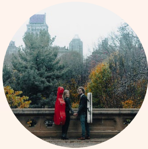
Enduring Love Stories February 9-11, 2024