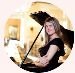
Mozart & Prokofiev May 10-12, 2024