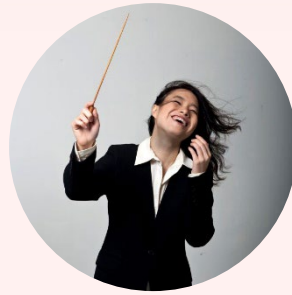
Copland & Bernstein March 8-10, 2024