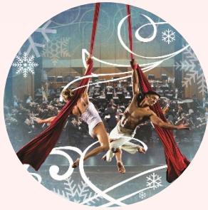
Holiday Cirque! December 16, 2023