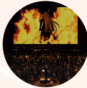
Distant Worlds: music from FINAL FANTASY March 23, 2024