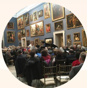
Art in Song February 25, 2024