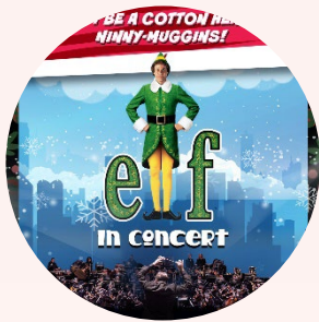
Elf in Concert December 22 - 23, 2023