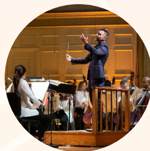
Vivaldi's Gloria April 12-14, 2024