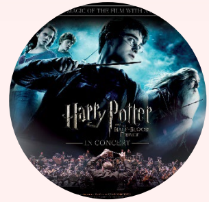
Harry Potter and the Half Blood Prince April 20, 2024