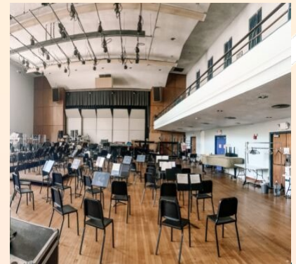
Rehearsal space at 61 Woodland Street, Hartford will need to be replaced.

Go to hartfordsymphony.org/open-positions to learn more.