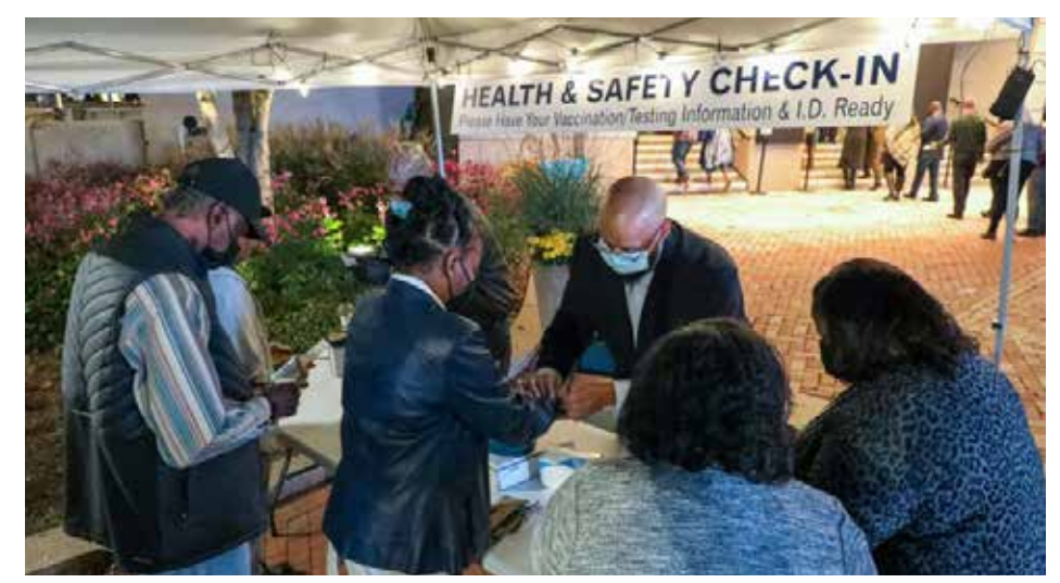
Vaccine checks for all patrons.