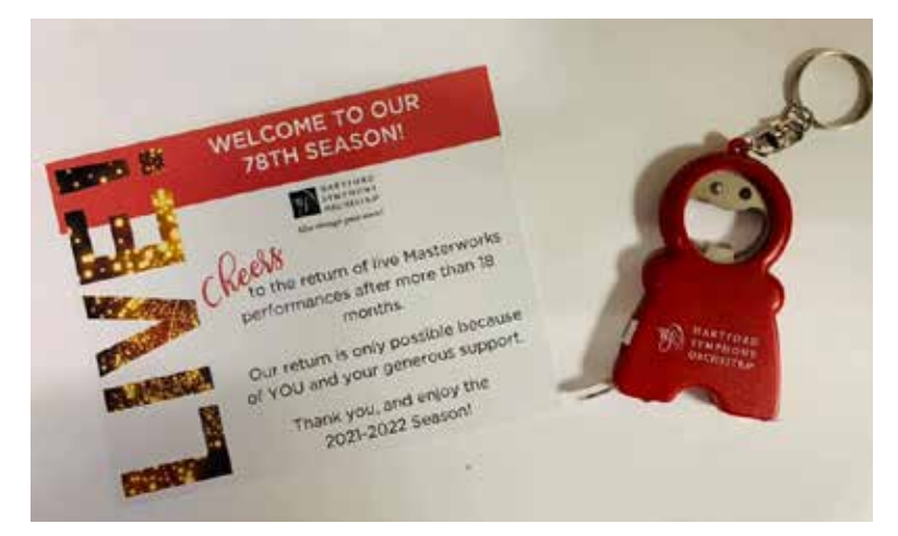
Welcome back thank you card and HSO key chain