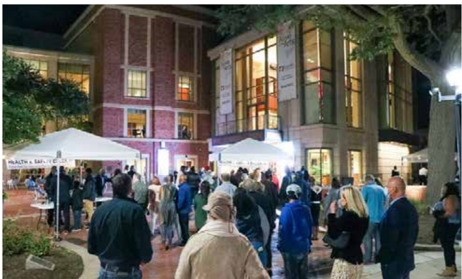
Patrons returning for HSO's opening night.