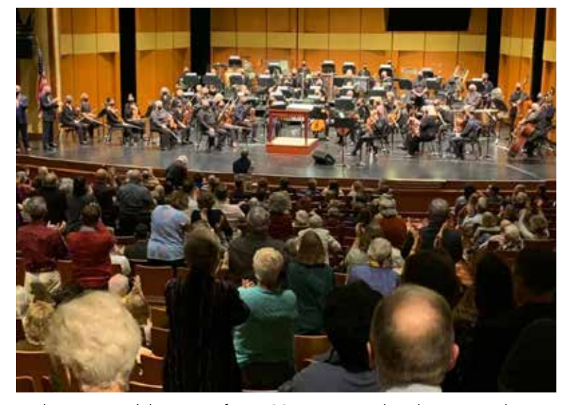
Audience greeted the return of our HSO musicians with enthusiastic applause and a standing ovation % \left( {{{\rm{A}}_{\rm{B}}}} \right)