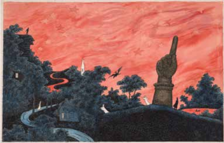
Edward Gorey, Haunted America , 1990. Watercolor, pen and ink, and pencil on paper, Wadsworth Atheneum Museum of Art