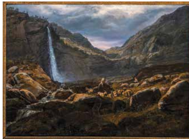
Johan Christian Clausen Dahl, View of the Feigumfoss in Lysterfjord , 1848, Oil on canvas, Private Collection, New York