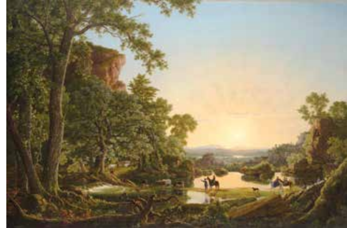
Frederic Edwin Church, Hooker and Company Journeying through the Wilderness from Plymouth to Hartford, in 1636, 1846 , Oil on canvas, Wadsworth Atheneum Museum of Art

We delve into Gorey's Worlds for our March Sunday Serenades concert, in celebration of the exhibition, Gorey's Worlds , exploring the artistic inspiration of the famed American artist and author, Edward Gorey. For more than fifty years, Gorey delighted and amused audiences with spare pen and ink drawings that illustrate tales of hapless children, kohl-eyed swooning maidens, and whimsical creatures. The program will include Mozart's elegant and playful Sonata in E-flat Major , K. 292/196c, Schnittke's humorous Moz-Art , Britten's eerie Phantasy , and Shostakovich's melancholic Piano Quintet in G minor , Op. 57.