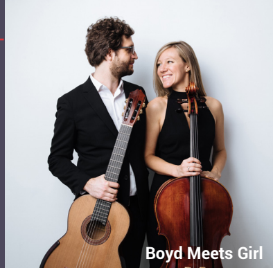
Boyd Meets Girl